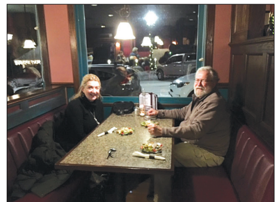
Photos from the pasta dinner fundraiser.